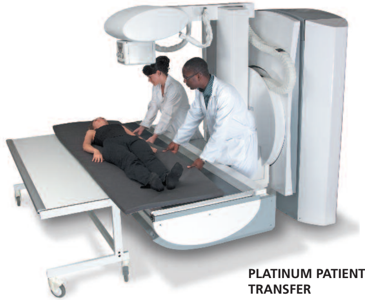
PLATINUM PATIENT TRANSFER

A pulsed fluoroscopy functionality allows for optimizing lower dose and reducing radiation up to 90%. The resolution is up to 3.4 lp/mm.